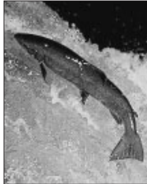
Dams have decimated wild salmon populations in the US.

Kainji Dam in Nigeria, for example, directly displaced 50,000 people, but adversely affected hundreds of thousands more because of declines in crop production and fish catches. Some 40,000 people living in the Amazon basin suffered from skin rashes and other health impacts due to the release of dirty water from the Tucuruí reservoir.