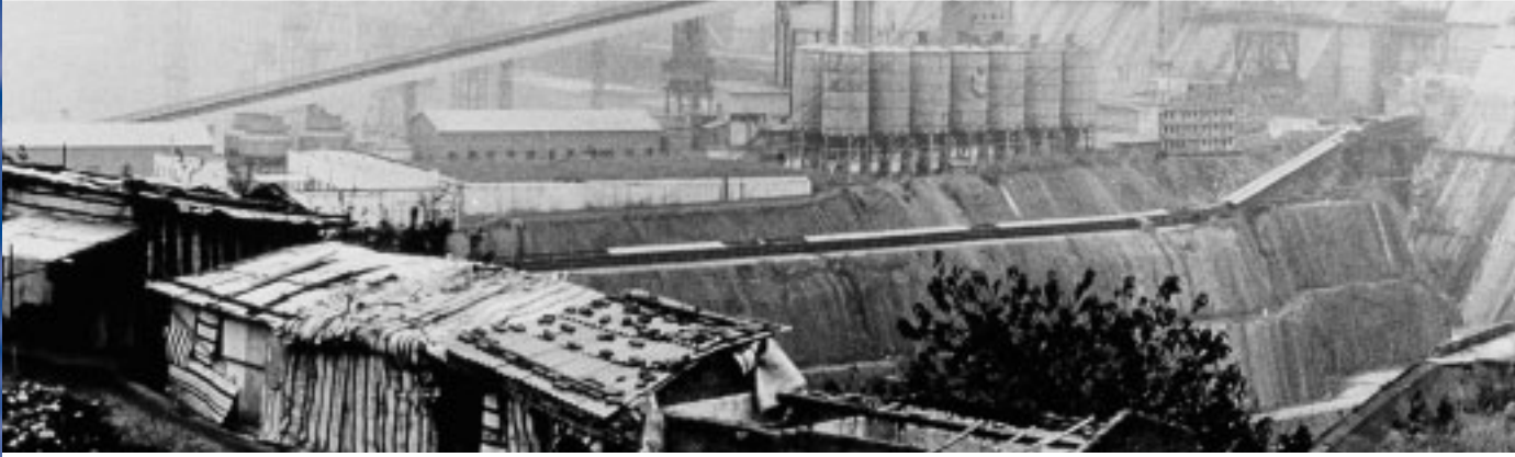
Nearly two million people will be displaced by China's Three Gorges Dam.